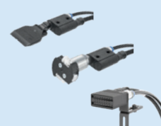
Ion blower nozzles