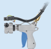
Ex-Ion blower guns