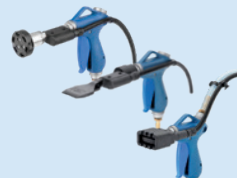
Ion blower guns