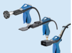
Ion blower pistols